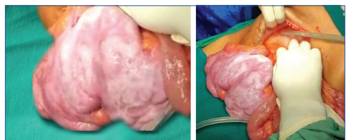
[Table/Fig-2]: Clinical image showing small bowel encapsulated in the form of cocoon. [Table/Fig-3]: Intraoperative image showing evacuation of gross ascites. (Images from left to right).