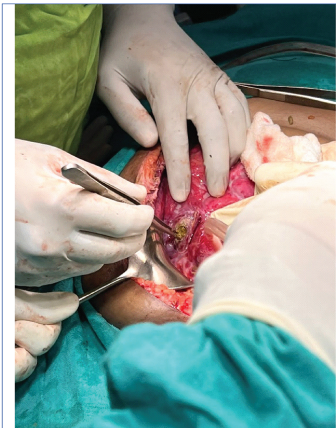
[Table/Fig-4]: Intraoperative image of perforation 200 cm distal to DJ flexure.